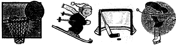
Basketball, Skiing, Ice Hockey, Figure Skating

Sign up forms for these activities will be available at your local schools at the beginning of their seasons.